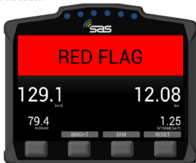
SCREEN 11. RED FLAG in Stage Mode

SCREEN 11 – Once the red flag has been acknowledged, normal stage functions will display with a warning still at the top of the screen.